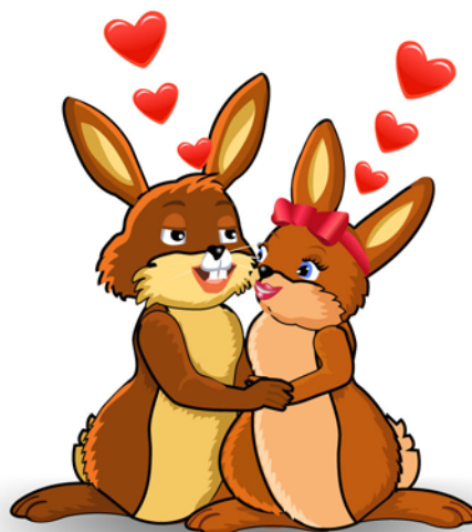
feel - felt - felt