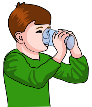
drink - drank - drunk