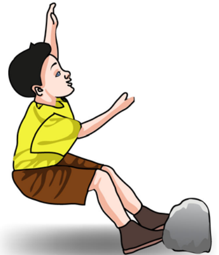
fall - fell - fallen