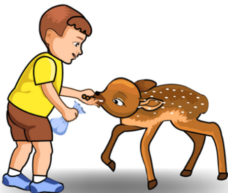
feed - fed - fed