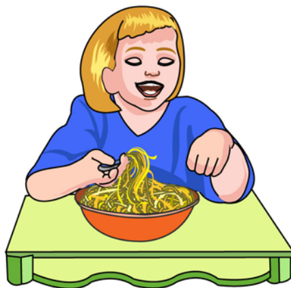
eat - ate - eaten