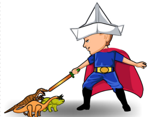
fight - fought - fought