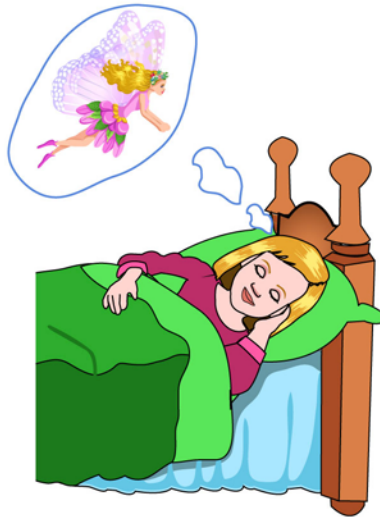
dream - dreamt - dreamt