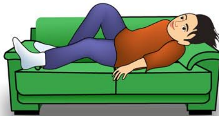
lie - lay - lain