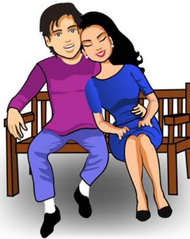
lean leant/leaned leant/leaned