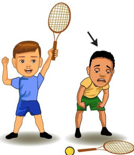
lose - lost - lost