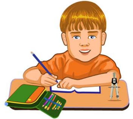
learn learnt / learned learnt / learned