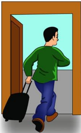
leave - left - left