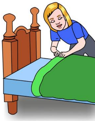
make - made - made