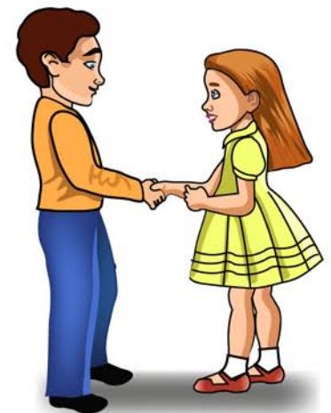
meet - met - met