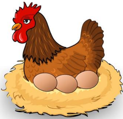
lay - laid - laid