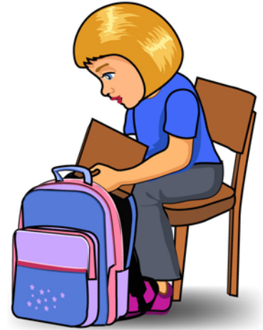
put - put - put