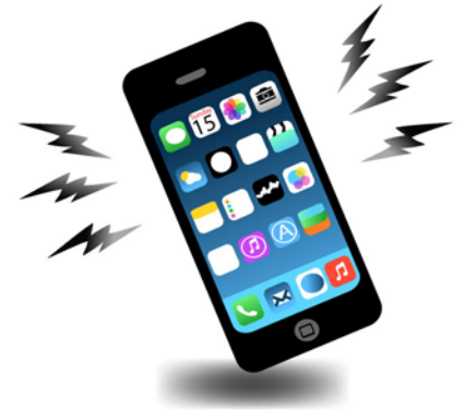
ring - rang - rung