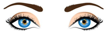
see - saw - seen