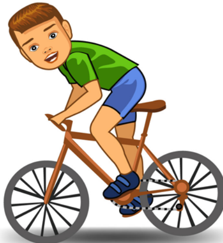
ride - rode - ridden