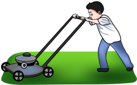
mow - mowed - mown/mowed