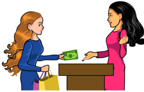
pay - paid - paid