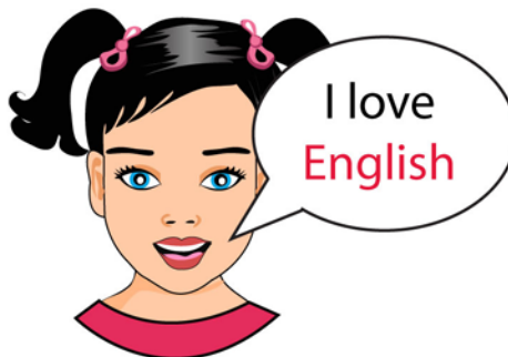
say - said - said