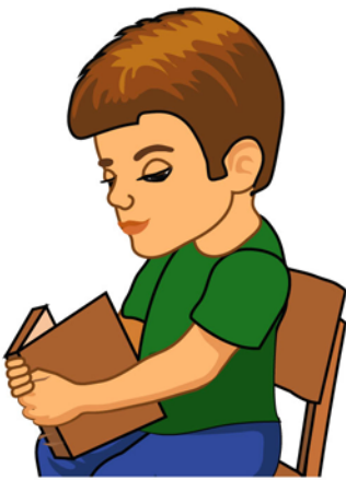
read - read - read