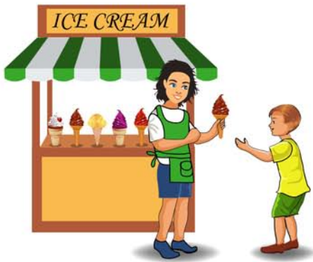
sell - sold - sold