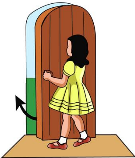
shut - shut - shut