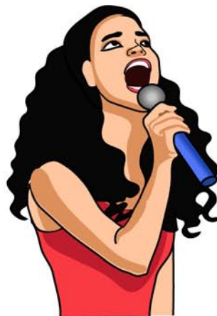
sing - sang - sung