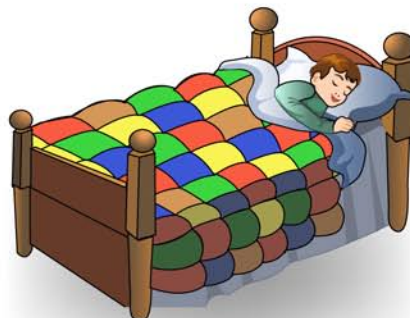
sleep - slept - slept