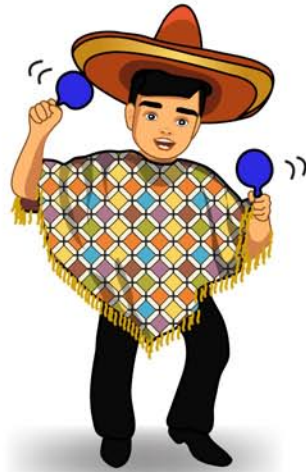
shake - shook - shaken