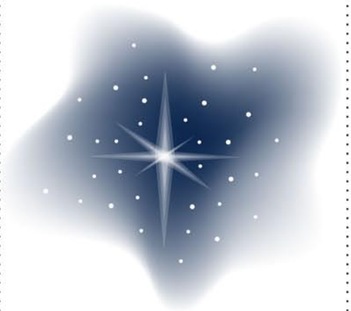
shine - shone - shone