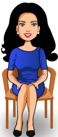
sit - sat - sat