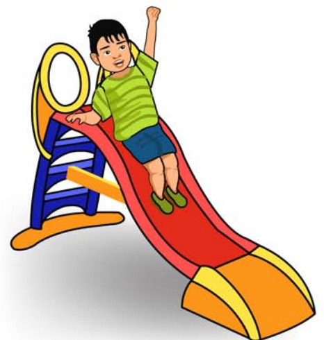
slide - slid - slid