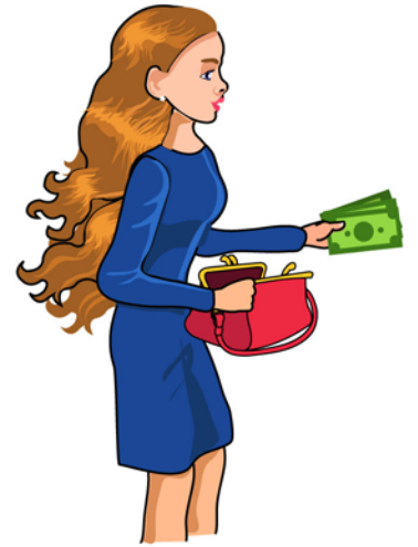
spend - spent - spent