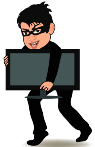
steal - stole - stolen