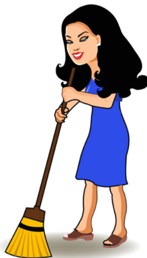
sweep - swept - swept