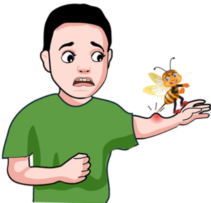
sting - stung - stung