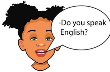
speak - spoke - spoken