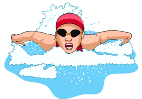
swim - swam - swum