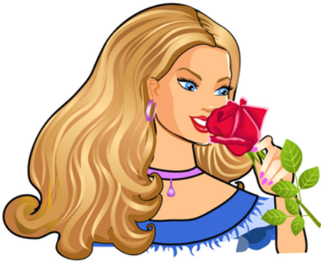
smell - smelt - smelt